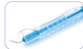
Blade ready to use