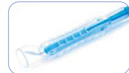
Blade in Safety Cap